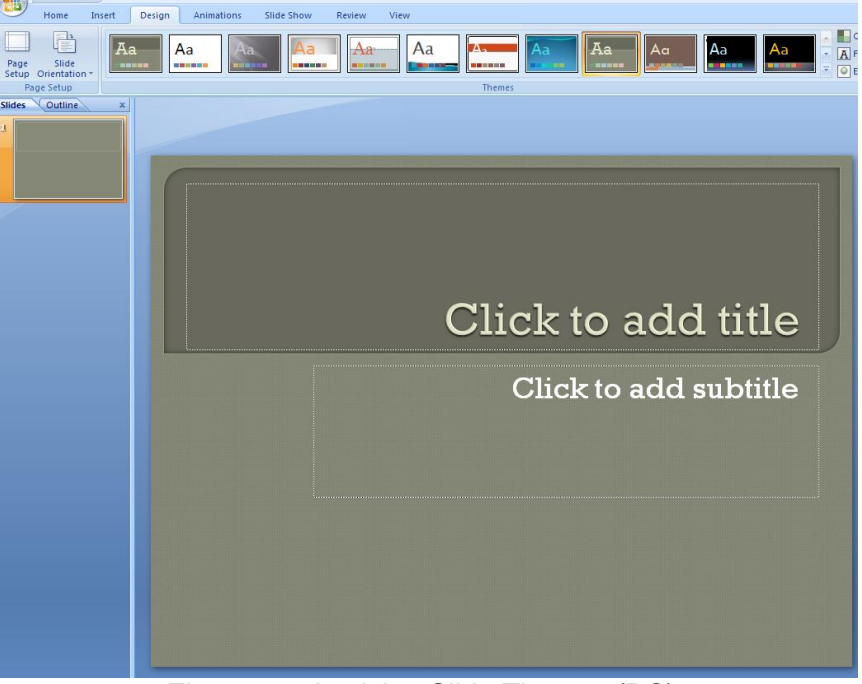
Figure 12. Applying Slide Themes (PC).

The default slide design for a Microsoft PowerPoint document is a blank slide. If you want your slides to have a design, you must add one. To do this, go to Tool Ribbon > Design Tab (Figure 12) and select the design that you like. The design is instantly applied when you click on it.