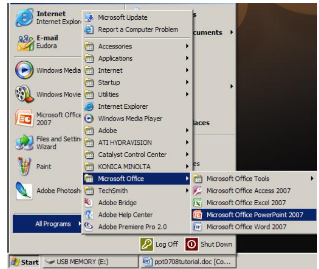
Figure 1. Navigate to Microsoft PowerPoint on a PC.

To launch Microsoft PowerPoint, go to Start > Programs > Microsoft Office > Microsoft PowerPoint 2007 (Figure 1). A blank presentation will open.